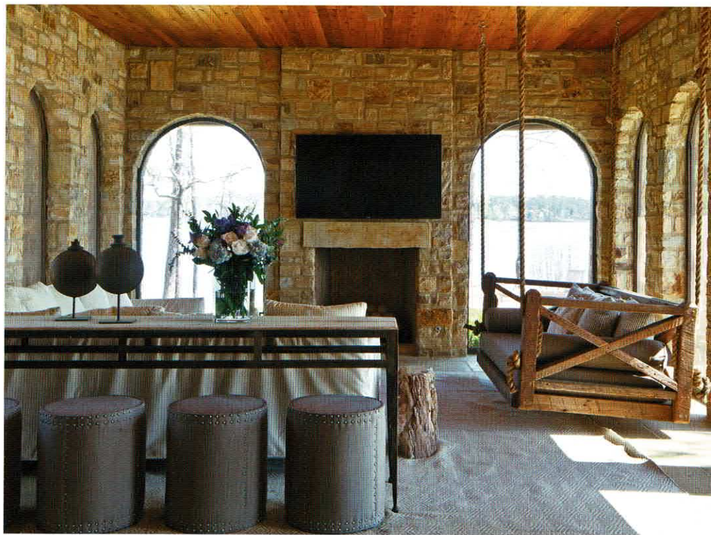
Left: In the kitchen, an X-braced island and steel range hood bring a note of simplicity to the otherwise luxurious setting. Extra-wide barstools are comfortable for adults and allow kids to double up. Telescoping doors disappear into the walls to connect the kitchen and porch. Above: The screened porch extends the entertaining area outdoors with a seating area, television, and a swinging bed. Below: The pool deck melds seamlessly with the lake beyond.