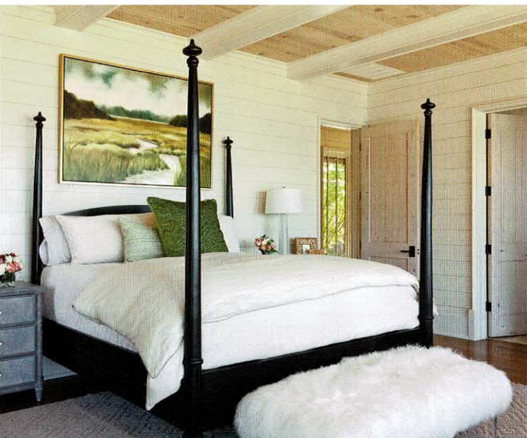
Above left, top left, and top right: In the master bedroom, a traditional four-poster by Noir serves as the room's centerpiece. A textured wool rug by Dash & Albert provides softness underfoot. A landscape by Barbara Cosgrove echoes the watery view from the bed. Above right: In the master bath, marble tile floors and walls lean toward formality, while punched metal panels on the vanities lend a farmhouse vibe.