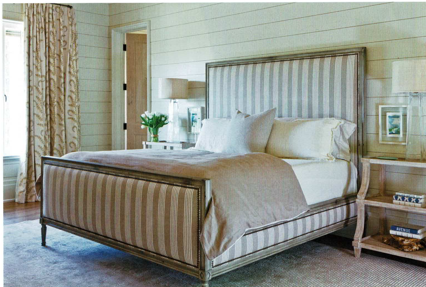
Above and top: Tongue-and-groove paneling gives the guest master suite casual elegance. A handsome bed by Hickory Chair establishes a note of tailored comfort. The bedside tables are by CFC, and the lamps are by Barbara Cosgrove.

With all these amenities available in such a dreamy setting, it's easy to imagine this as more than a second home. But for the Price family, it's just what they needed—a resort-like escape from the hectic pace of everyday life.